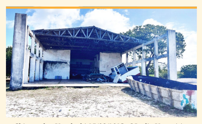
Ship yard at Kunduchi 25/08/2023.

(https://www.youtube.com/watch?v=xG5QM6aQlzY&t=29s) to educate the community about preserving the eel fish.